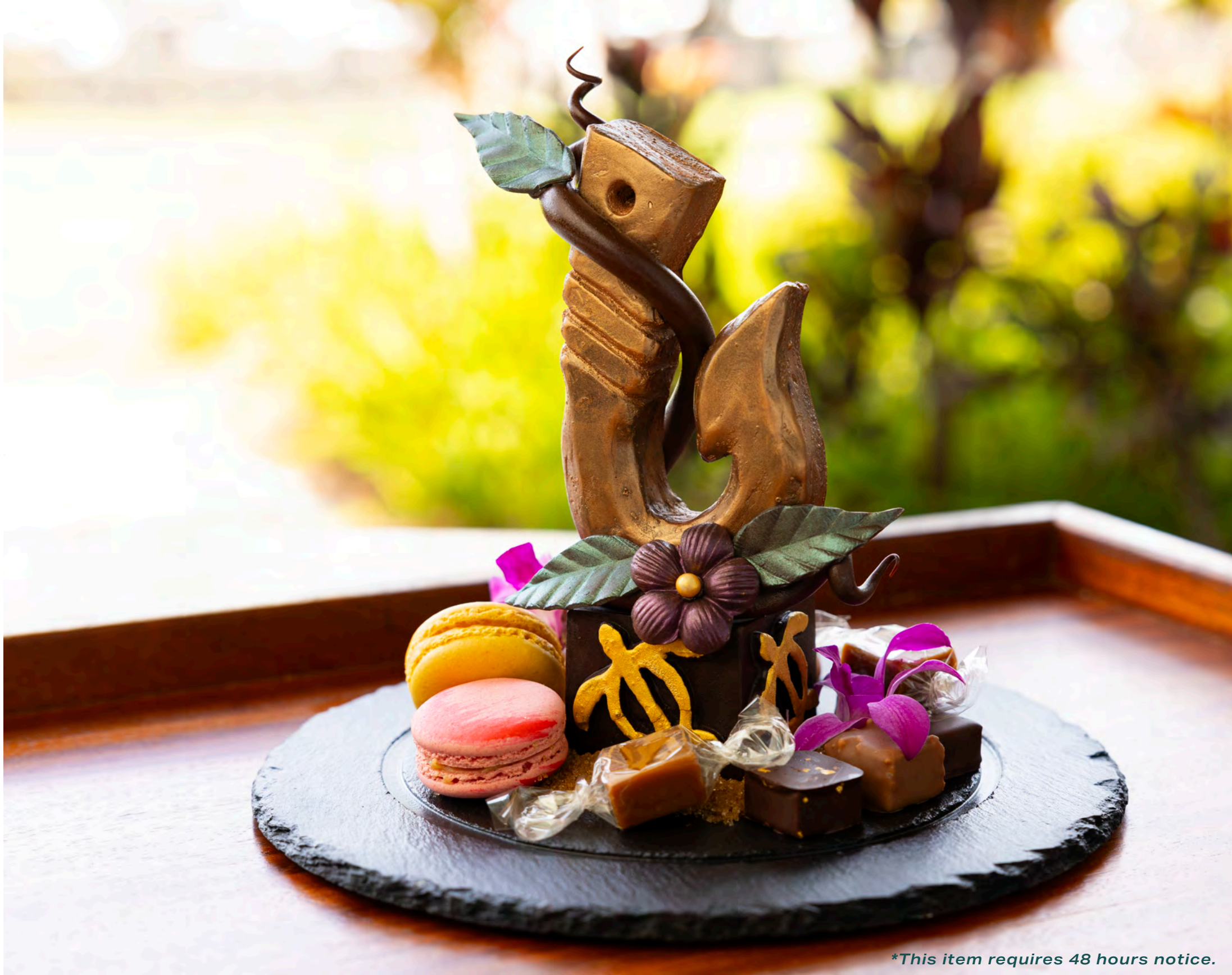
*This item requires 48 hours notice.